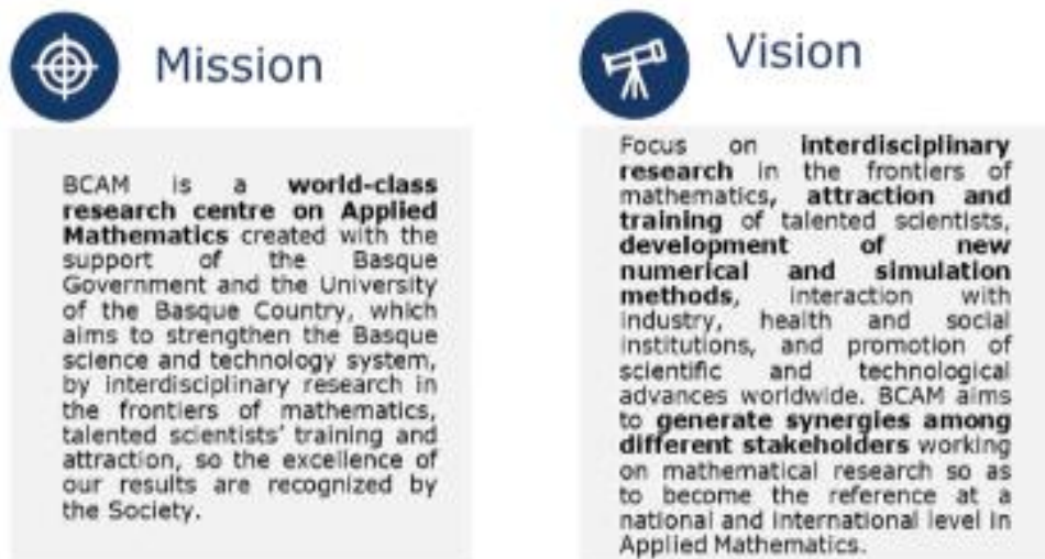
Figure 1. BCAM mission and vision

BCAM is part of the BERC (Basque Excellence Research Centres) network. Located in Bilbao, the Basque Country, it benefits from a long industrial tradition, and is linked with the French Atlantic Corridor, a region with a tradition of excellence in Applied Mathematics, being the coordinator of the TRANSMATH UPV/EHU - U. Bourdeaux joint cross-border research laboratory TRANSMATH.cross-border TRANSMATH.